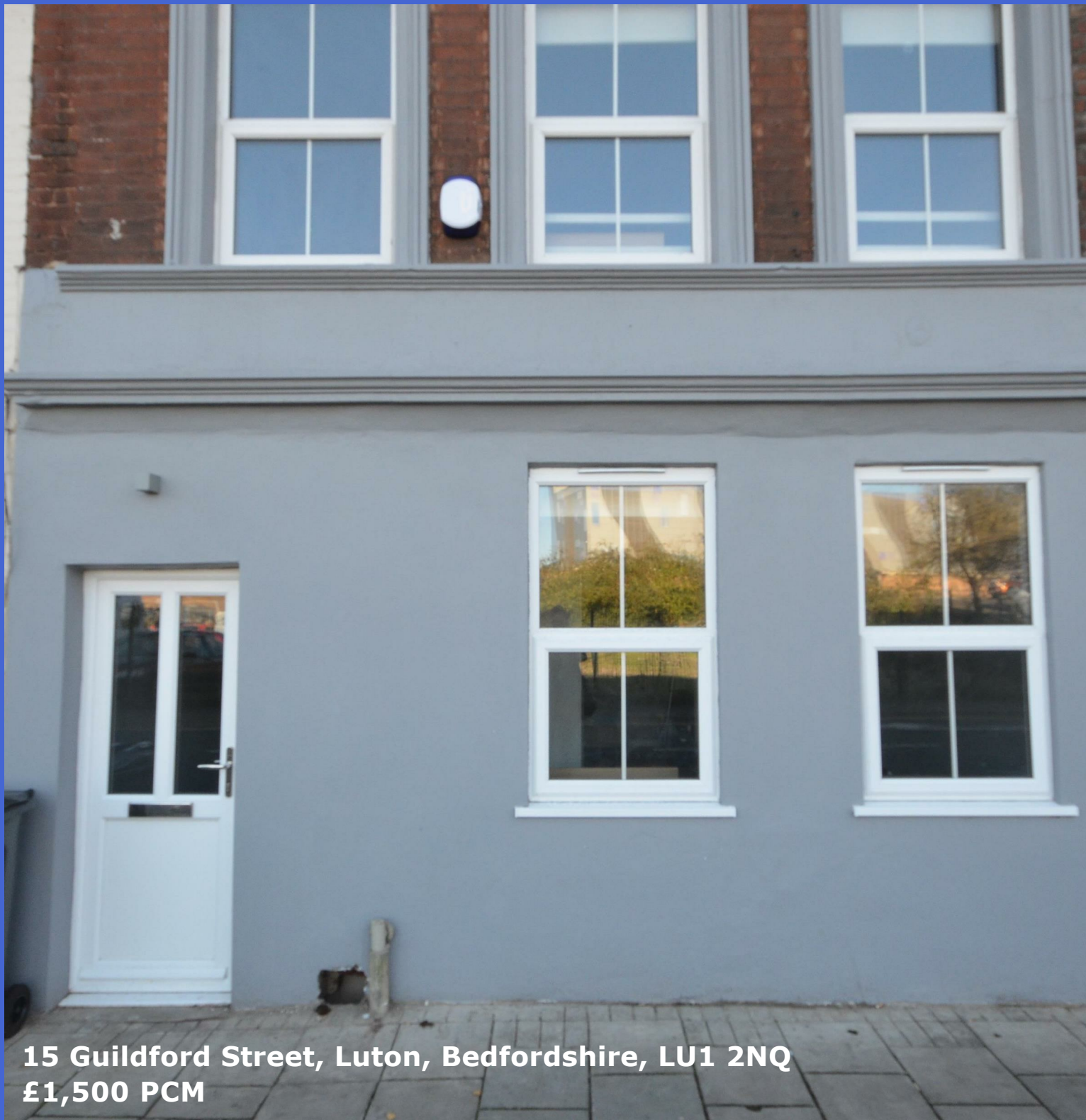
15 Guildford Street, Luton, Bedfordshire, LU1 2NQ £1,500 PCM